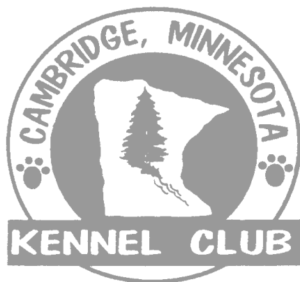
Member of the American Kennel Club

PROOF OF CURRENT RABIES VACCINATION MUST BE IN THE POSSESSION OF EXHIBITORS OR HANDLERS FOR ALL DOGS AT THESE TRIALS.