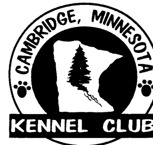
Member of the American Kennel Club