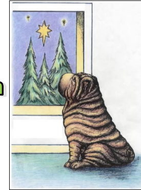
Licensed by the American Kennel Club