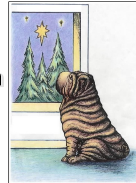
Licensed by the American Kennel Club